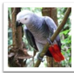
Congo African Grey Parrot in a bird park.

As we all know, wild-caught adult cockatoos simply do not make good pets. It is important if a cockatoo is desired as a pet that it is acquired in the first year of its life. Birds after about a year of age do not tame down satisfactorily. In fact, parent-raised cockatoos, even year-olds, can be difficult and the most desirable birds are those which are hand-reared from a very early age. It is fraudulent for wild-caught adult birds to be marketed as potential pet birds. The consumer is simply not getting what he expects and this can eventually lead to neglect and mistreatment of birds. Information is mounting throughout the world to show that there is a very high death rate in wild-caught birds supposedly to be used as pets, with George Smith of the UK quoting figures around 80% as being the death rate among African Grey Parrots in the first year of their captivity. Perhaps it occurs soon after the new owner realises that the bird he has bought is inappropriate as a pet, and then doesn't know what to do with it.