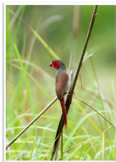
Crimson Finch (White-bellied)

Another thing that you read about them is that as soon as a young cock shows a single red feather you should get them out or their old man will slaughter them. I haven't found this to be the case. I usually like to leave mine in there until at least the next clutch fledges. One of my aviaries is reasonably large and sometimes I don't get in there and catch them all so there will be two clutches out and the first birds are almost fully coloured with no issues. I keep a number of birds in a holding aviary and I have had no issues so I think they have had a bit of bad rap.