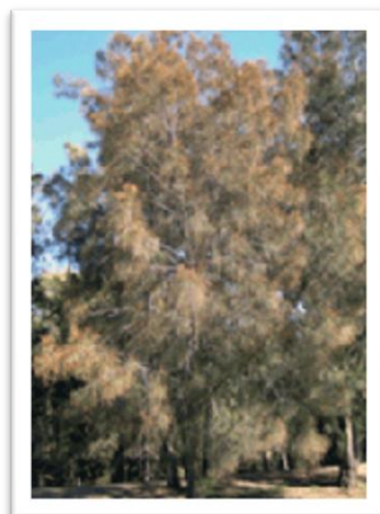
Casuarina (Cunninghamiana) Tree in flower.

Then along came "Burkett" an Eastern Rosella baby who had fallen from his nest with no parents around to take care of him. We took him in and hand-raised him.