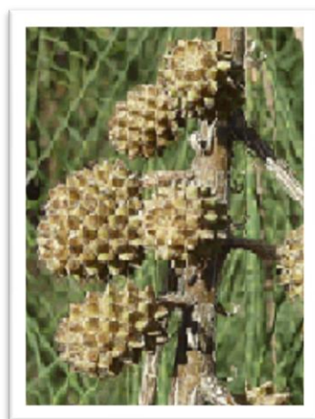
Immature seedpods.