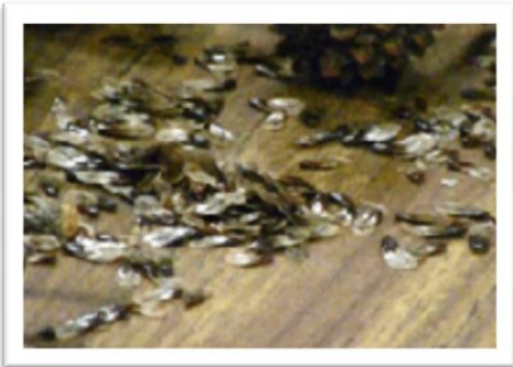
Winged seeds of the Casuarina

The Casuarinas are such a great source of food for so many of our native birds that it was not hard to research and find dozens of photos on the internet of the different species that feed on them either directly or indirectly, or nest in them, or rely on them for shelter and camouflage.